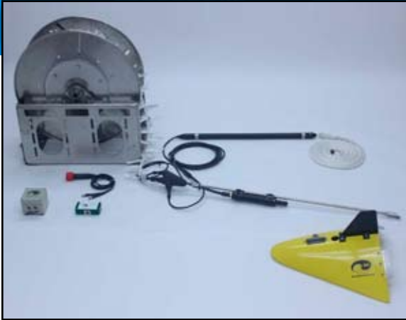
Portable Towed Directional Sensor

GeoSpectrum Technologies Inc has been manufacturing world-class sound source transducers for over 20 years.