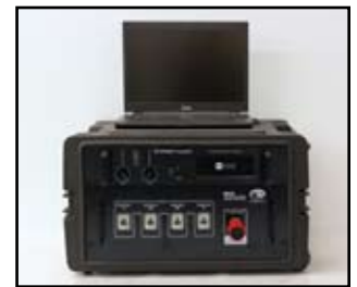
Power Supply & Signal Conditioner

Rely on GeoSpectrum Technologies for accurate customized detection.