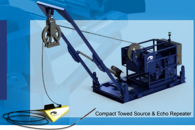
Compact Towed Source & Echo Repeater

GeoSpectrum Technologies provides an array of towed sound sources to suit your application, from individual components to turn-key systems comprised of towbody, sound source and handling system.